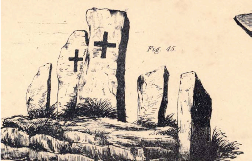
Rev. J.G. Cumming, The Runic and Other Monumental Remains of the Isle of Man (London: Bell and Daldy, 1857). Figure 45 on Plate xiv.