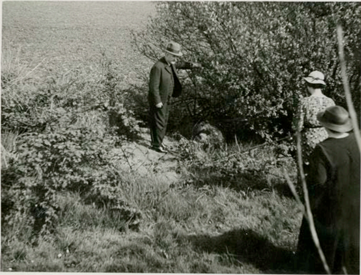
St. Patrick's pillow. Ballafreer.